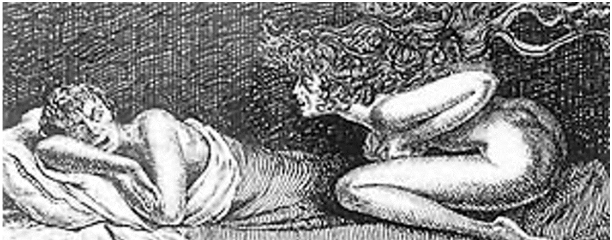
In the Jewish tradition, Lilith usually appears as a female demon. This demon possesses men against their will in order to bear children by them

Most people when asked “Who was the first woman on Earth?”– they will answer: “Eve, created by God out of Adam’s rib.” AND THEY would be WRONG – the first woman was Lilith 2 .